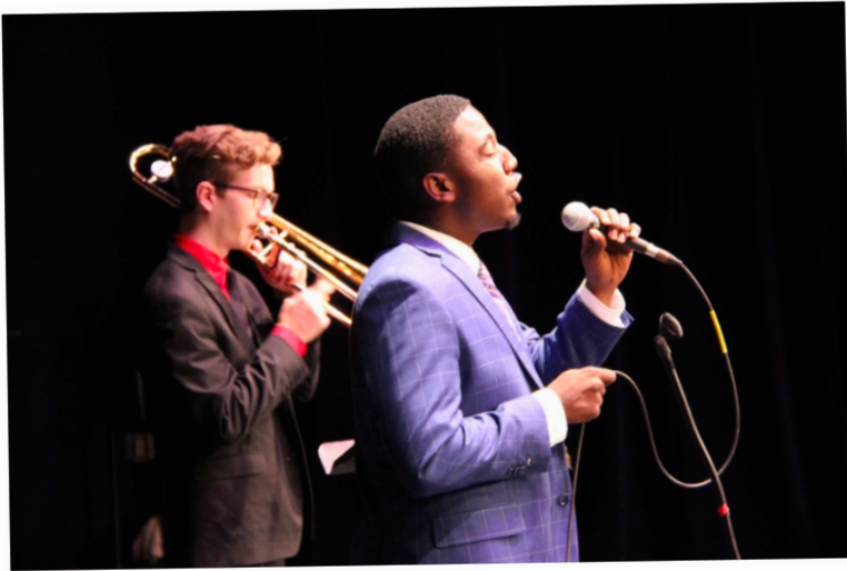
Spring Jazz Combo Concert, 2018

The Alexander W. Dreyfoos School of the Arts is a magnet school that is open by audition, portfolio screening, or writing sample review with lottery.